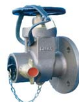
Dry Riser Valves (to BS5041) Complete With Strap, Padlock, Cap and Chain.

Dry riser gate valves act as outlets from the riser main. These valves are situated on each floor of the high rise building and are normally housed in outlet cabinets which are manufactured to BS5041 part 5. Dry riser gate valves come complete with inlets flanged 65mm BS4504 PN16, 2.5"BS10 table D and screwed 2.5" BSPT, outlets to BS336, complete with blank cap and chain, complying to BS5041 part 2. To the top of riser should be fitted with an air release valve which releases all air from the riser, as water is pumped in, but closes automatically under pressure of water. A 1" drain valve can be used at the bottom of the riser if the pipe work goes below the inlet breeching valve, so the system can be completely drained. RECOMMENDED MOUNTING 750mm FROM FLOOR TO VALVE CENTRE